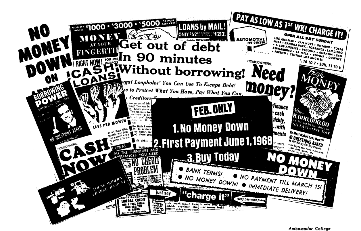
TEMPTATION — Many succumb to the temptation of this type of advertising, only to suffer financial worries.

is a good system of saving which puts the debtor on a regular monthly budget, thus enabling him to "save" what he never would have saved otherwise.