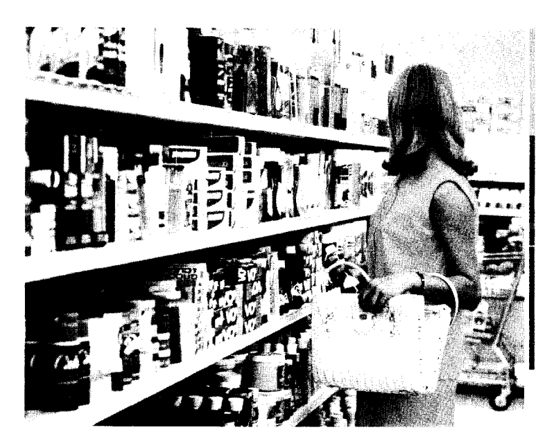
SHOPLIFTER — In spite of millions spent for TV cameras, mirrors and store detectives, shoplifters continue to steal merchandise.

PROTECTION AGAINST CUSTOMERS — Because losses from shoplifting are skyrocketing, many retail stores are installing closed-circuit television cameras to watch customers.